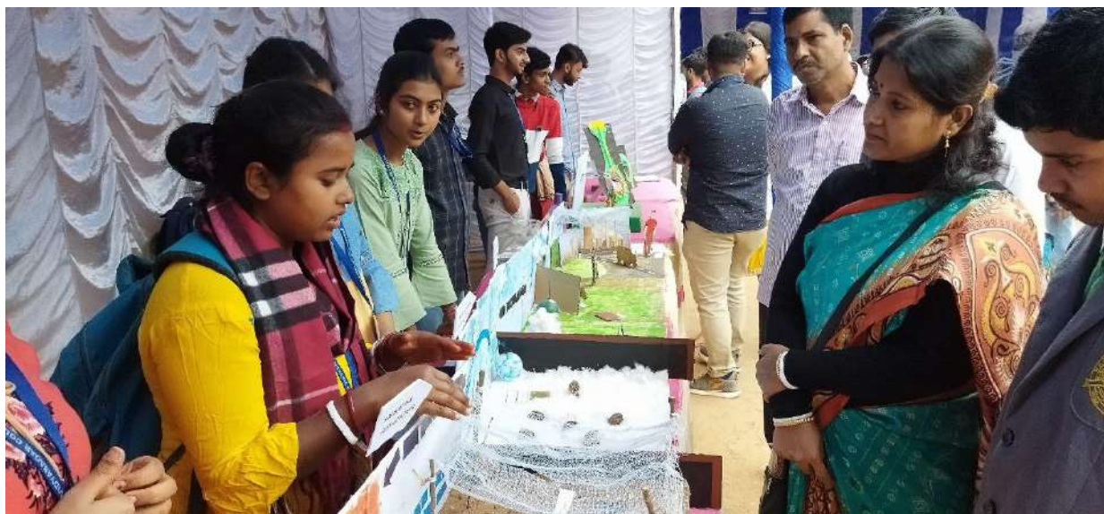
Students are demonstrating their Models in front of visitors