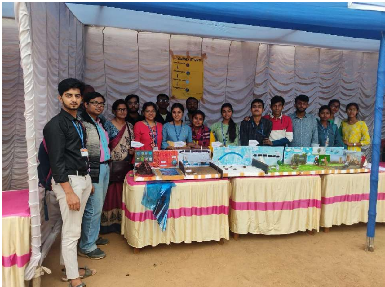
All the participated students of Botany with Faculty Members