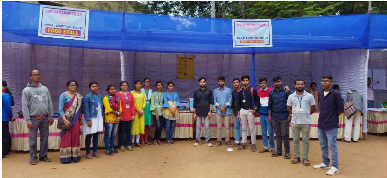
All the participated students of Botany with Faculty and Staff Members