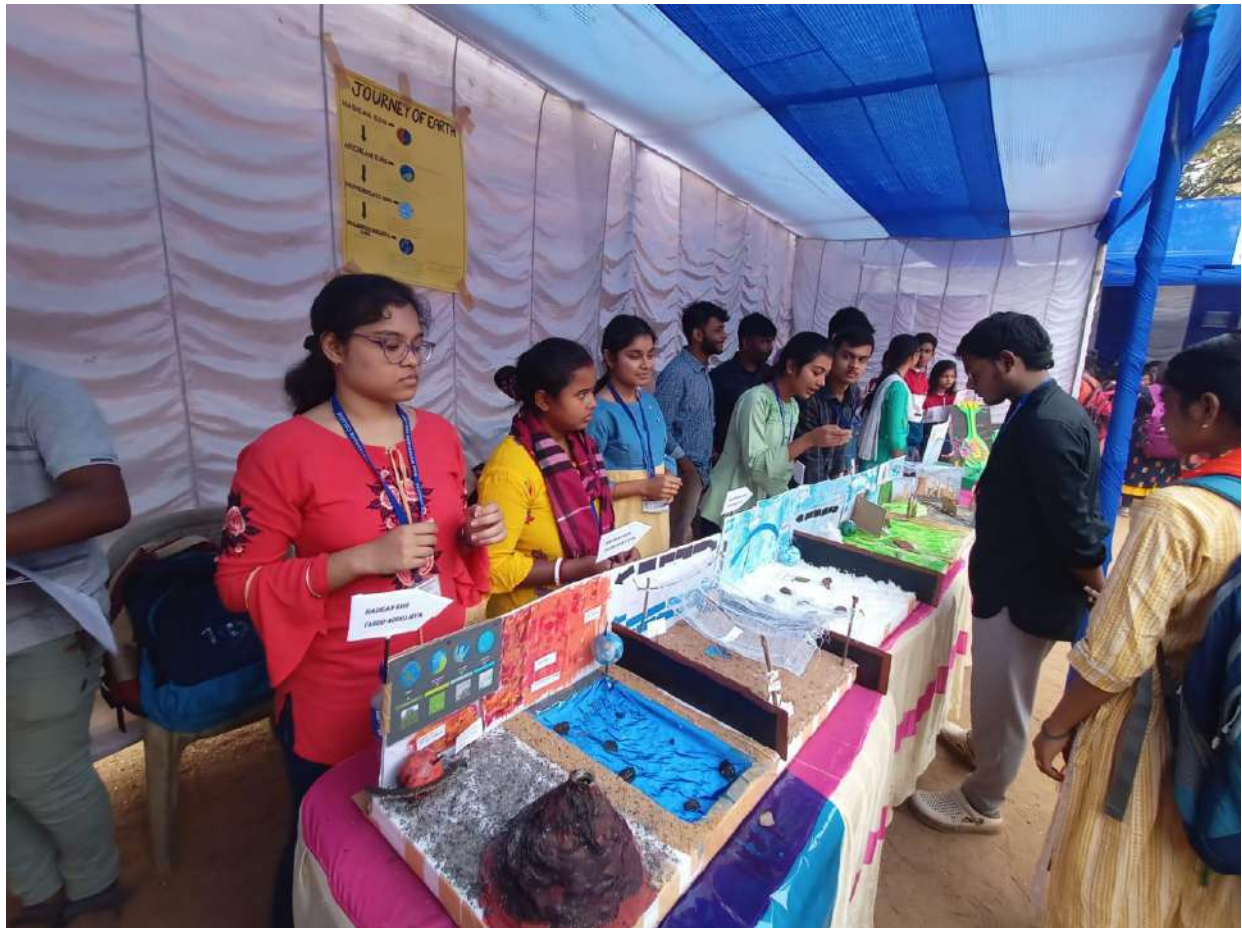
Students are demonstrating their Models in front of visitors