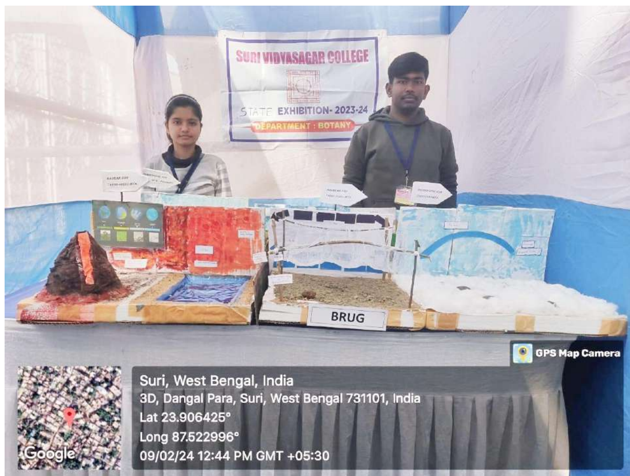
Exhibiting Model at District Student Youth Science Fair